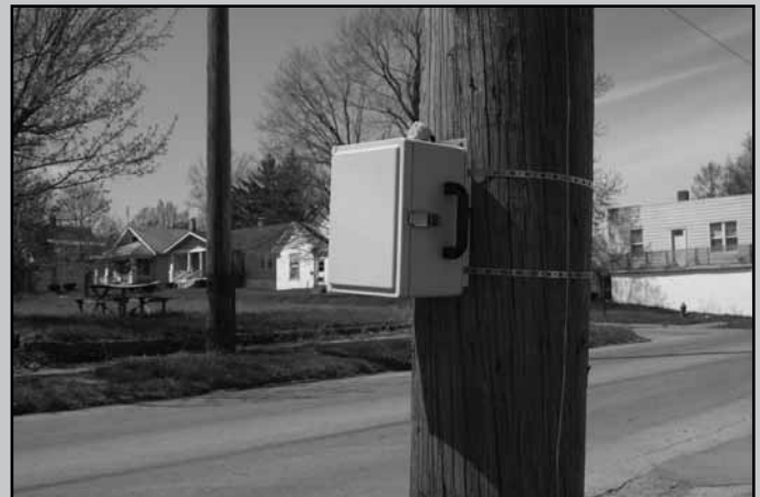
Mounted on a sturdy road side pole, the SpeedSpy is unnoticed by passing motorists.