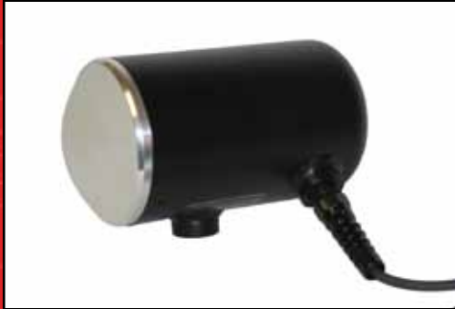
SI-3 K-Band Antenna is covertly mounted inside unit.