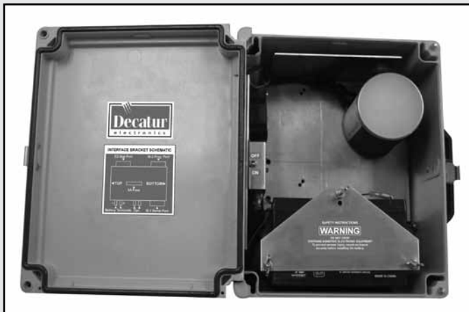
Internal view of SpeedSpy, including EZ Stat, power supply and protected SI-3 K-band antenna